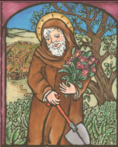
ST. FIACRE Patron of Gardeners